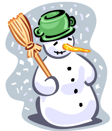
What do snowmen eat for breakfast? Snowflakes.

Come in and enter your name for 2 adult (18 & over) tickets to the Senior Wheat Kings home games. We also are having a members only draw for 3 beautiful Christmas baskets and 2 children's baskets, so don't forget to stop by and enter. Please join us for your coffee break on Thursday, December 20 th from 1:30 – 3:30 for dainties and coffee. Dainties will be made & supplied by the staff.